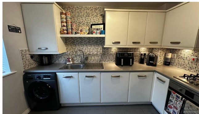
Pel Crescent Oldbury, B68 8SS Offers Over £290,000